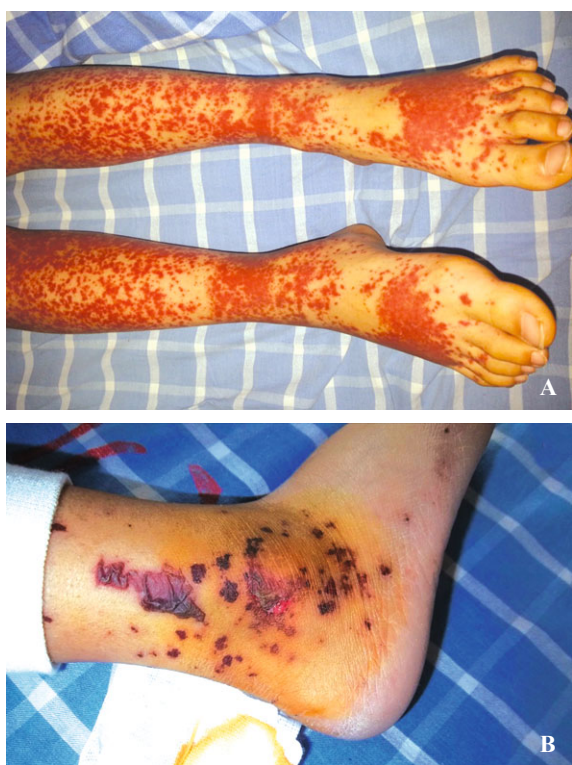
Fig. 1. Skin lesions in children with Henoch-Schönlein purpura. Petechiae and palpable purpurae are the most common skin lesions (A), but erythematous, macular, urticarial or even bullous rashes (B) are observed occasionally (Department of Nephrology, Children's Hospital, Zhejiang University School of Medicine).

affected children, the outcome of HSP is excellent, with resolution of symptoms and signs within several days or months. The long-term morbidity of HSP is related to the degree of renal involvement. Previous studies [2,3] have reported that up to 30%-50% of pediatric patients with HSP either have or will develop hematuria and/or proteinuria as symptoms of nephritis within 4 to 6 weeks of the initial presentation, both of which are typically minor in extent or self-limited. However, approximately 20% of HSPN patients (7% of all HSP cases) will develop either a nephritis or nephrotic syndrome. In specialized centers, the proportion of children with HSPN progressing to renal failure or end-stage renal disease ranges from 1% to 7%. [1,4-9]