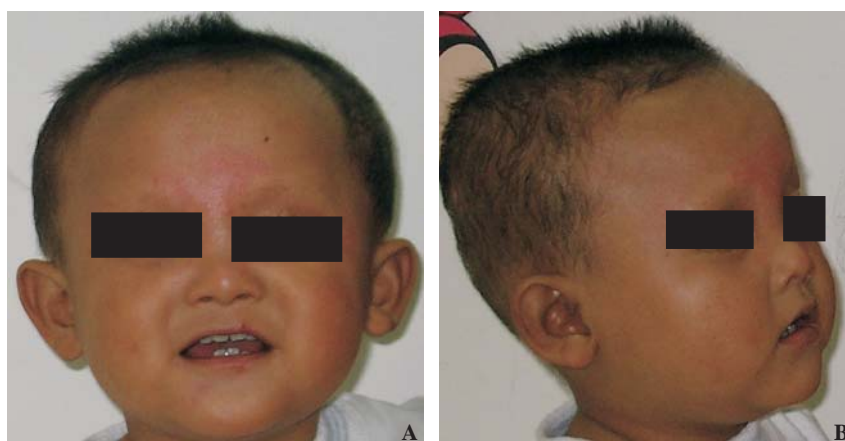
Fig. 2. Characteristic faces of Alagille syndrome. A: a child aged 1 year and 7 months with prominent forehead, deep-set eyes, mild hypertelorism, pointed chin, and saddle shape nose with a bulbous tip; B: the lateral profile was flat with prominent ears.